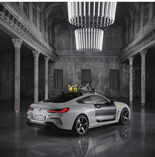
Vagabund Moto