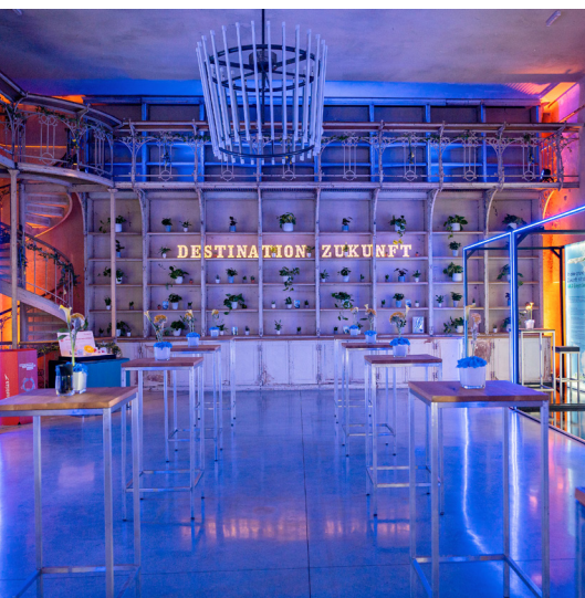
Destination Zukunft