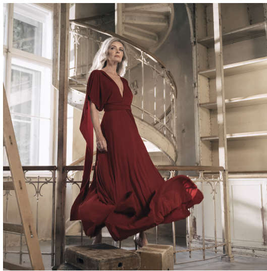
Paulina Porizkova for Vienna Fashion Awards